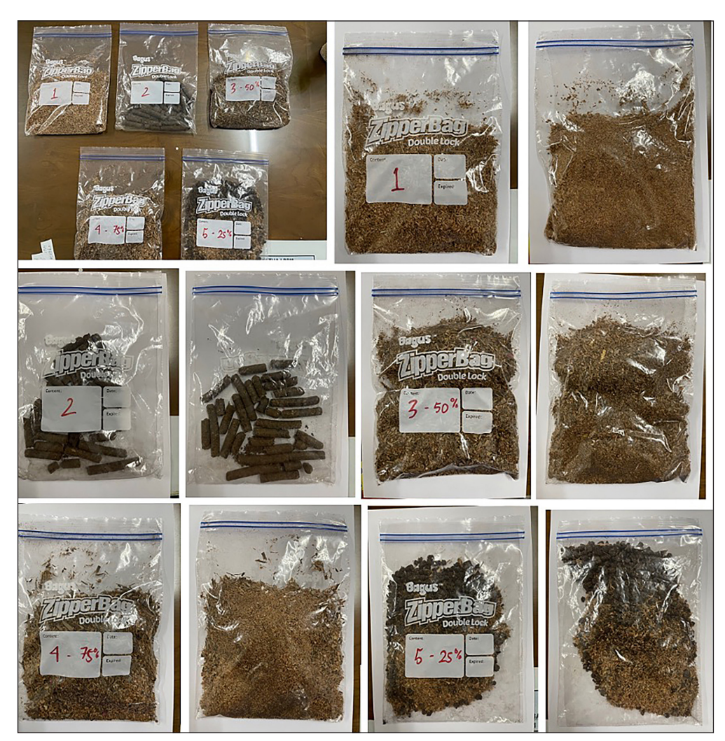
Figure 1. RDF material samples

Biomass briquettes are made using a press machine to print biomass into a pellet shape with a length of 5–10 cm and a diameter of 1 cm. The dried temple waste then proceeds to some machines to produce the RDF. A chaft cutter machine (MCC) series 6-200 with GC-200 Engine and 6.5 horsepower (hp) was used to grind the