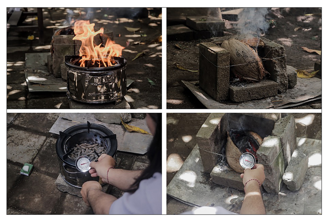
Figure 2. Product combustion and durability test

reduce the presence of contaminants and increase their durability in storage. Infrastructure for storing RDF, such as appropriate flooring, drainage systems, fire prevention measures, and adequate space for equipment manoeuvrability, is essential for guaranteeing its durability. Monitoring RDF on a regular basis is necessary to detect degradation or changes in its properties over time. This may entail periodic sampling and analysis of RDF samples in order to evaluate variables such as moisture content, energy content, and physical properties. By implementing appropriate storage practices and maintaining suitable storage conditions, stored RDF can be optimized, ensuring that its quality and energy content remain suitable for combustion or other uses.